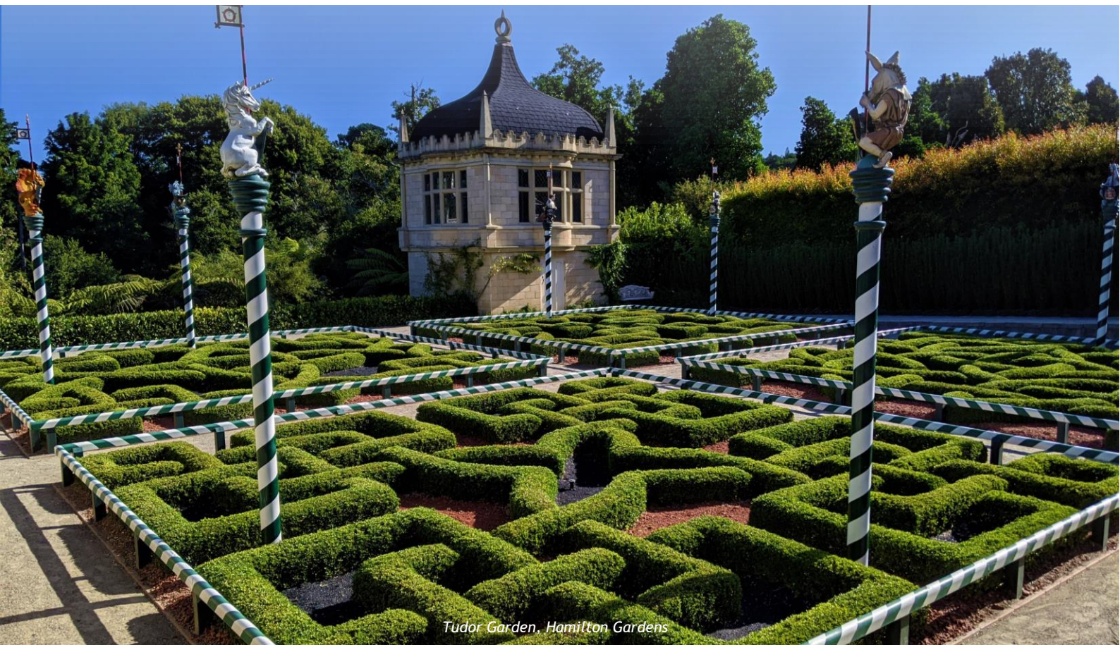
Tudor Garden, Hamilton Gardens